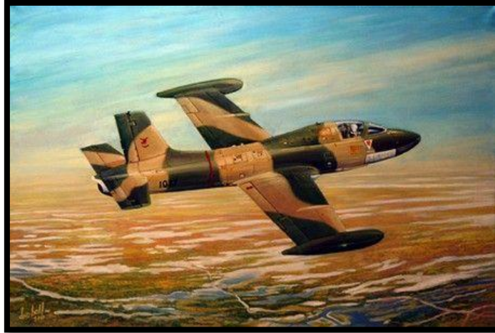
Painting: Don Bell - "SAAF Atlas Impala Mk.II - Border Patrol"